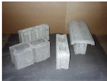
Fig. 1. Recycled Concrete Blocks Made with Recycled Aggregate

Bedoya [2003] claims in his master's thesis that there is a cultural issue regarding the use of recycled concrete that has to be considered in the future. People, including owners, contractors and designers, are not willing to use concrete with recycled aggregates since for them recycled means useless or bad quality. He mentions that as result of a former experimental project conducted by himself [Bedoya, 1999], a concrete block manufacturer produced prefabricated concrete pieces [Figure 1] such as masonry blocks and curbs using recycled aggregates. The mean compressive strength over the gross area of the samples tested was 4.8 MPa that is higher than the required by the Colombian Standard for masonry blocks.