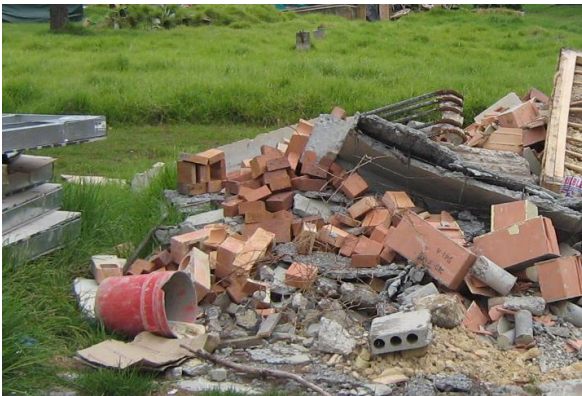
Fig 5. Material Resulting from Testing at the Materials Laboratory