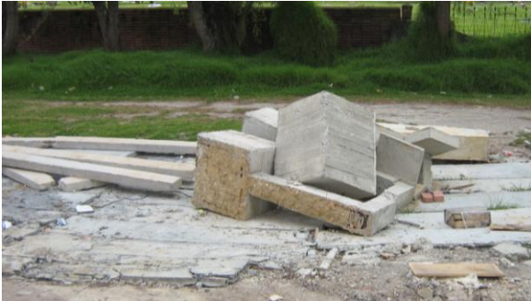
Fig 4. Material Resulting from Research Projects