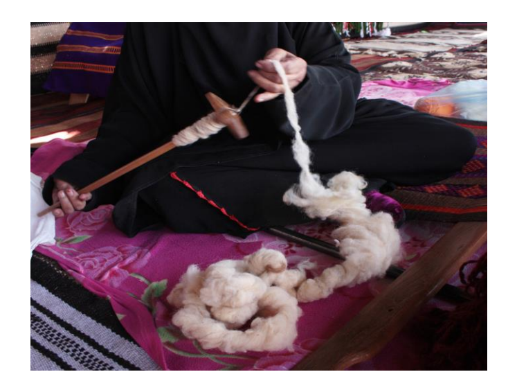
Figure 3. Women weaving of the Goat Hair to make the Fabric of (Bait Al-Sha'r)

The interior of (Bait Al-Sha'r) divider (Al Gateh) is both functional and decorative. The most highly ornamented of (Al Gateh) is facing the men's and guests' sitting room. The (Al Gateh) is very large. It can be twenty-five feet long or longer and six or seven feet high. Furthermore, the dividing curtains are decorated in contrast to the exterior walls, which are plain or simply ornamented. The Beit Al-Sha'r wall is usually made of four or five long, narrow strips, which are sewn together with large iron needles and heavy, highly-twisted yarn. Women usually spin their own sheep's wool and goat hair on hand spindles for (Bait Al-Sha'r).