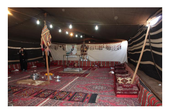
Figure 2. Showing (Bait Al-Sha'r) and the inside divider (Al Gateh).

for example, divides the house into two main sections. The first is the living quarter designed for the use of closely related members of the family, particularly the female members. The second area is designed for male visitors and guests. This area is arranged so as to be independent from the rest of the house thereby allowing male visitors easy access without disrupting the privacy of female householders. These two part are divided by dividers (Al Gateh). Moreover, the two areas can be extended through the flexibility of the way the dividers (Al Gateh). Also, the exterior wall (Al Ruaag) can be easily moved to provide more spaces and more privacy according to the needs of the residents living in it.