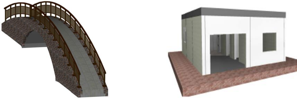
Figure 3. Proposed demonstration projects – FlexiArch (left) and precast demonstration dwelling (right).

The first demonstration project is Macrete designed FlexiArch bridge system, which will be used to construct a pedestrian bridge on the campus of University of Malaya in Kuala Lumpur. Sunway will be producing the bridge components using the geopolymer mixes developed at the University of Malaya and Monash University. Ikhmas Jaya Group Berhad will be carrying out the necessary geotechnical surveys, groundwork and constructing the bridge on the campus.