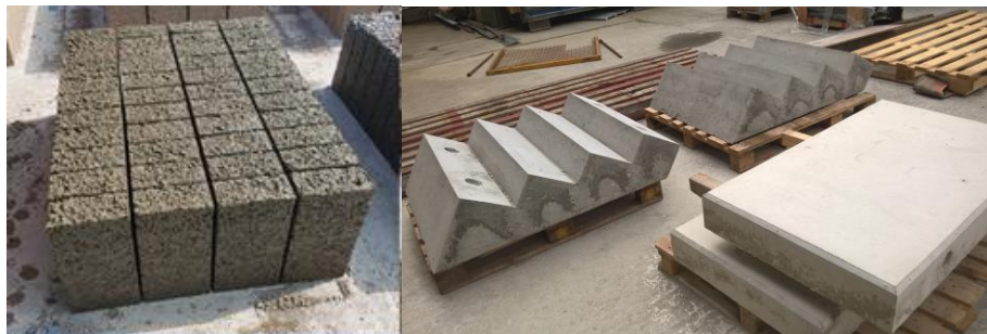
Figure 2. Geopolymer specimens manufactured in Creagh Concrete Ltd.

For the block trials a 30/70 FA/GGBS mix was activated with commercial silicates. A conventional Portland cement (PC) mix was cast at the same time to act as a control mix. The first batch manufactured was too dry and while blocks were cast, they were not successful. For the next two batches, additional water was added. Two sets of blocks were cast from each batch. One set of each batch was covered with timber boxes and the other set remained uncovered. The blocks that remained uncovered had a higher level of efflorescence than the covered blocks. Despite the efflorescence there is little difference between the compressive strength values of the covered vs. uncovered mixes. Both mixes achieved above the minimum 4-day strength of 3MPa. For the 28-day strength, for both covered and uncovered specimens, one mix achieved just below the requirement of 7MPa, with 6MPa whilst the other mix achieved 10MPa. This disparity between strength values may be attributed to the water content. The first batch had a drier consistency and the water content was corrected for the subsequent batch, which performed better.