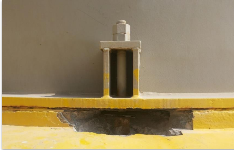
Figure 2. view of the broken anchor bolt and the chipped foundation