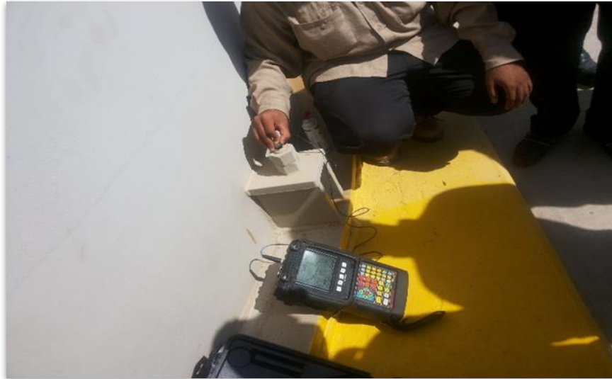
Figure 4. view of performing the UT technology

Data is acquired by using a hand-held, battery-operated ultrasonic flaw detector as shown in figure 5. Non-destructive UT is implemented using straight-beam configuration. Therefore, the range highlighted in figure 5. was increased to the total length of the existing anchor bolt which was 1165 mm. Figure 6. shows the UT small probe called ultrasonic transducer that was used in order to launch longitudinal wave to the surface of the anchor bolts that being tested.