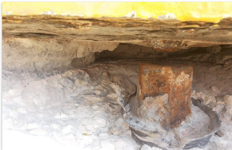
Figure 3. view of the broken anchor bolt

It was difficult to perform the conventional method and exposing all the embed anchor bolts where 448 anchor bolts have to be exposed at the subject facility. Thus, ultrasonic testing technique was performed to determine the condition of the embedded anchor bolts as shown in figure 4.